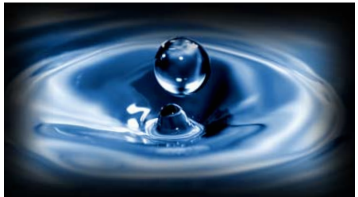
A single drop of water

The future of Stony Brook Southampton is inextricably linked to the fabric of Southampton Township, the East End of Long Island and the global dialogue on the environment. On the evening of October 9th we will host a symposium that brings together a diverse group of concerned individuals to canvas their notion of elements essential to the evolution of the town. Our goal is to provoke, record, define and present a holistic set of interconnected guiding principles for evolving our community in the 21st century. On December 13 we will present an interim summation of this discourse. During the years to come we will widen our conversation to an international level.