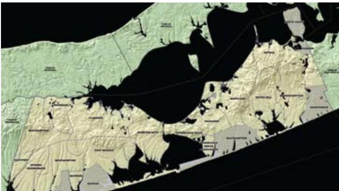
Map of Southampton Township